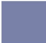
PANTONE® 17-3924 Lavender Violet