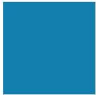
PANTONE® 18-4538 Hawaiian Surf