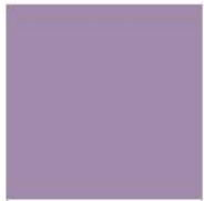
PANTONE® 16-3817 Rhapsody