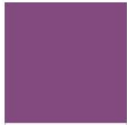
PANTONE® 19-3336 Sparkling Grape