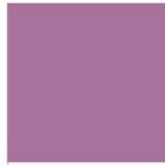
PANTONE® 17-3014 Mulberry