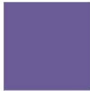
PANTONE® 18-3838 Ultra Violet