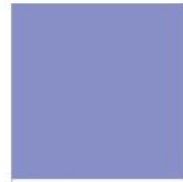
PANTONE® 17-3930 Jacaranda