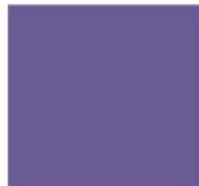
PANTONE® 18-3838 Ultra Violet