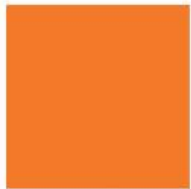
PANTONE® 17-1350 Oriole