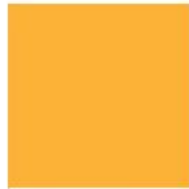
PANTONE® 14-0955 Citrus