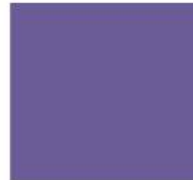
PANTONE® 18-3838 Ultra Violet