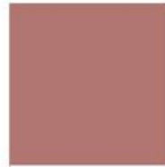
PANTONE® 19-1520 Canyon Rose