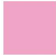
PANTONE® 14-2311 Prism Pink