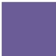
PANTONE® 18-3838 Ultra Violet