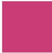
PANTONE® 18-2045 Pink Peacock