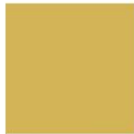
PANTONE® 14-0740 Bamboo