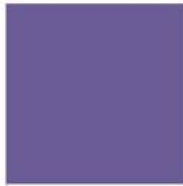
PANTONE® 18-3838 Ultra Violet