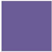
PANTONE® 18-3838 Ultra Violet