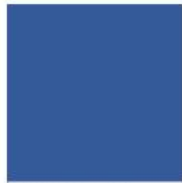
PANTONE® 19-4053 Turkish Sea