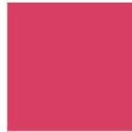
PANTONE® 18-1754 Raspberry