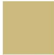
PANTONE® 14-0626 Dried Moss