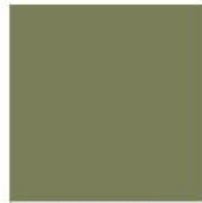
PANTONE® 18-0324 Calliste Green