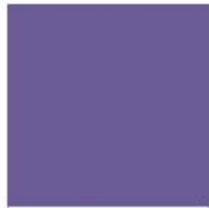
PANTONE® 18-3838 Ultra Violet