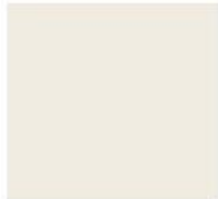
PANTONE® 11-0604 Gardenia