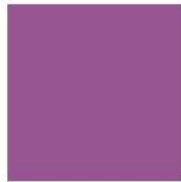
PANTONE® 18-3331 Hyacinth Violet