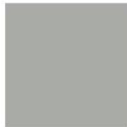
PANTONE® 14-5002 Silver