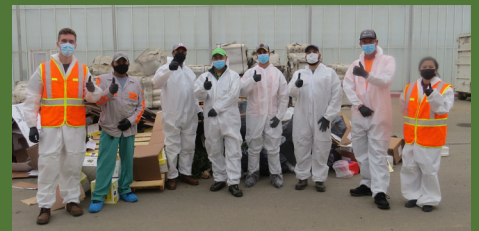
Windset Farms® tomatoes and cucumbers greenhouse operation, Santa Maria, California